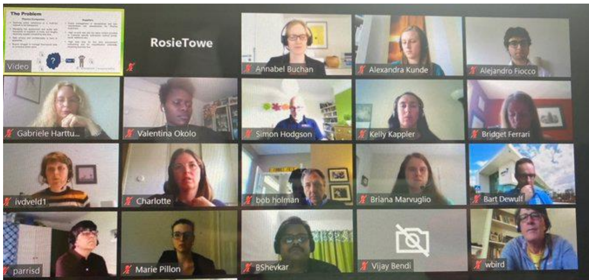
Virtual Spring Meeting, 13 May 2020

PSCI Chair and Global Quality Audit - Hub Director AsiaPacific at AstraZeneca